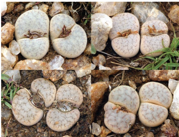
Figure 14: L. pseudotruncatella (J365) in habitat, April 2018, 105km WSW of Windhoek, 250km SE Brandberg

completely different (Figure 14). The same is true for the unrelated L. ruschiorum which grows 75 kilometres SW and SSE of the Brandberg. In any case, the area on and around the Brandberg remains a valuable area for more extensive field research.