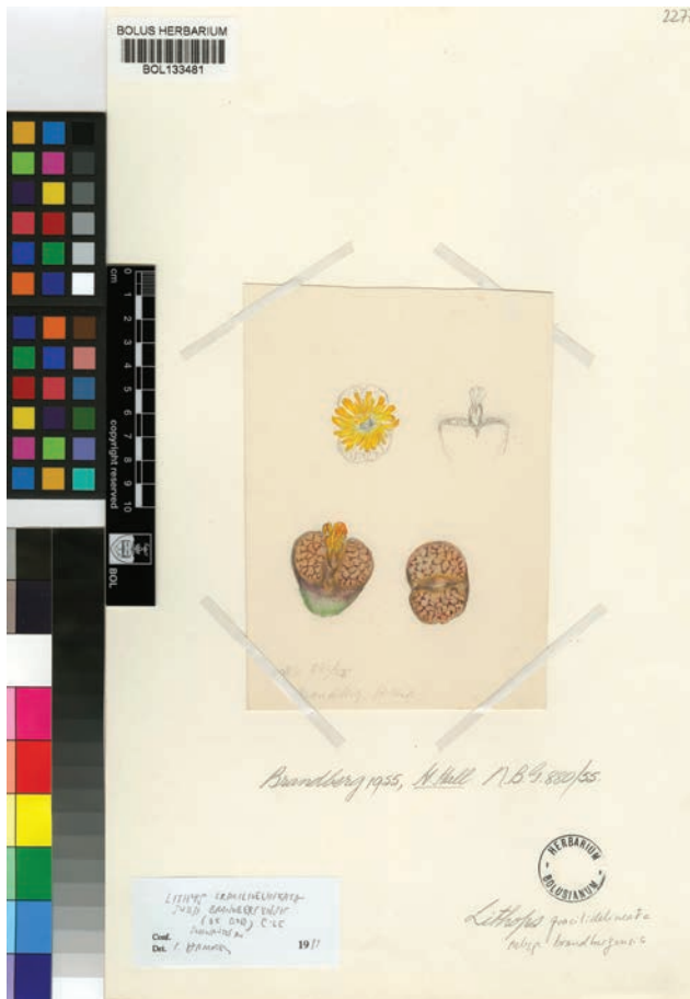
Figure 5: Botanical illustration of Lithops gracilidelinata ssp. brandbergensis (de Boer) D.T. Cole. Drawn from a collection made at Brandberg by H. Hall (sub-National Botanical Garden 880/55), 1955.

in vain to find a second colony. The Coles list this second unseen population as C394 (see Cole 1986 ) and this is possibly also the colony reported by Joe Walter or his German friend as being approximately two kilometres away from C383.