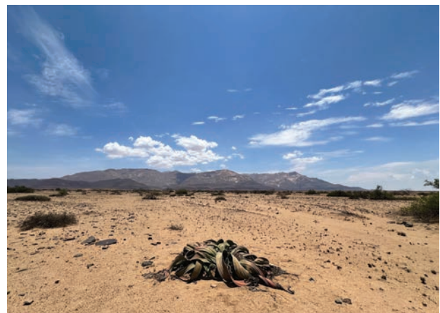
Figure 2: Brandberg, seen from south-west with Welwitschia mirabilis in the foreground, February 2024