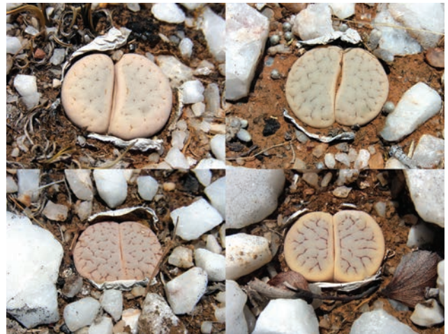
Figure 12: L. gracilidelineata syn. streyi (J240) in habitat, December 2013, 25km SE of Fransfontein, 115km NE Brandberg

gravel, not in white quartzite (Cole & Cole, 2012b). It can only be speculated that the reddish substrate has contributed in some adaptive way to the special colouration of the Brandberg Lithops. We have seen the same sort of morphological adaptation to red substrates in other species such as L. karasmontana . Lithops also vary in fruit and seed size since their morphology is influenced by nutrition or local conditions (Hammer, pers. comm.) and such variation in capsule size of C383 was noted by Earle (2020) who comments, 'large seed capsules (7-9 merous) were seen in habitat while these sized capsules are much less common in cultivation'. It should be added that morphological differences within 'typical' L. gracilidelineata (Figure 11, see Jainta 2024) and especially comparing the syn. streyi (Figure 12) often appear greater than differences between ssp. gracilidelineata and ssp. brandbergensis . For us, all forms, subspecies, or varieties belong to the same variable swarm of L. gracilidelineata .