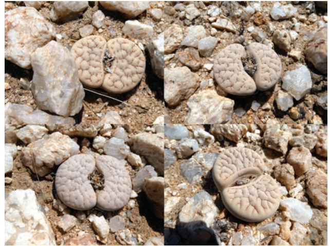
Figure 11: L. gracilidelineata (J515) in habitat, April 2022, 95km ESE of Swakopmund, 215km SSE Brandberg