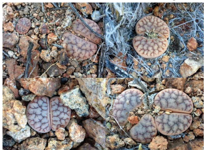
Figure 7: L. gracilidelinata ssp. brandbergensis in habitat (C383), April 2019.

Triebner was surely surprised by Rudner’s 1955 discovery and encouraged Schwantes to describe the plant as a new species before other botanists did. Schwantes was reluctant to do so due to similarities with L. dendritica and in a letter to Giess dated 11 September