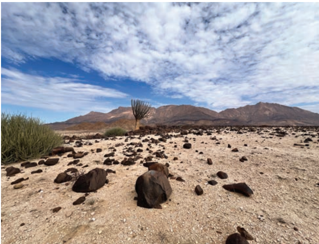
Figure 10: Near the habitat of L. gracilidelineata aff. brandbergensis (J239), February 2024, 20km W of Uis, SE of Brandberg