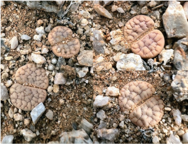
Figure 9: L. gracilidelineata aff. brandbergensis (J239) in habitat, February 2024, 20km W of Uis