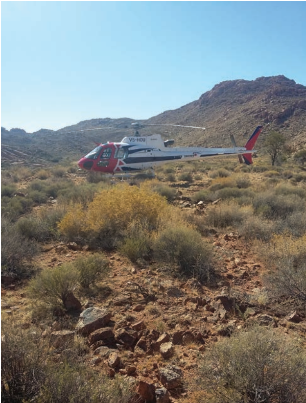
Figure 8: Landing site of the helicopter of the 2019 expedition near the locality of L. gracilidelineata ssp. brandbergensis (C383), April 2019.