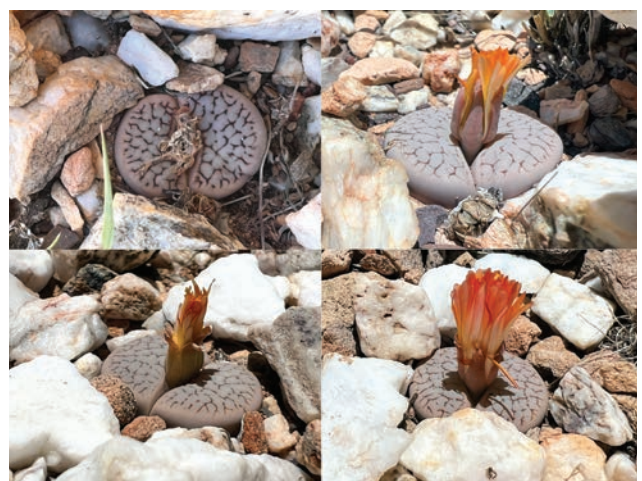
Figure 13: L. dendritica (J632) in habitat, February 2024, 75km SW of Rehoboth, 360km SE Brandberg

Schwantes, who believed brandbergensis to be a form of L. dendritica , was most likely influenced by the red dendritic lines which are especially vibrant in cultivated material and which are also seen in the wild when the plants are in a turgid state following rains (Figure 13). However, the distribution range