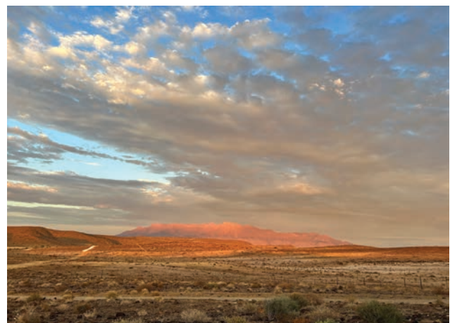
Figure 1: Brandberg, the burning mountain, seen from Uis, February 2024