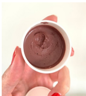
Figure 4: 20% red ochre and 20% Ximenia oil mixture combined with zinc oxide 15% ointment B.P.