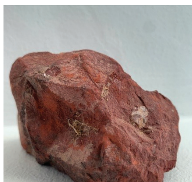
Figure 3: Red ochre rock found in Northern Namibia