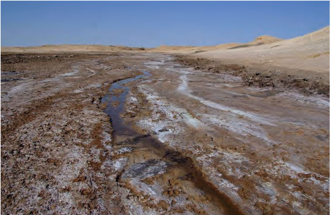
Plate 9: Hosabes saline spring and stream, with extensive crystalline evaporites

We have investigated several aspects of the microbiomics of saline spring ecosystems at Hosabes (near the Gobabeb-Namib Research Institute) and Eisfeld (east of Swakopmund), with a particular focus on the viral and phage communities. A survey of ssDNA viruses (Adriaenssens et al. 2016) demonstrated that a substantial majority of the