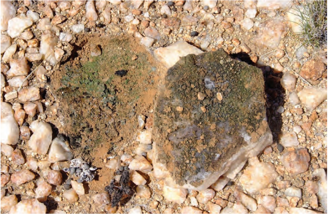
Plate 4: Uprturned quartz rock, showing the green mat of microbial life on the underside and the soil below the rock

after just two years under the translucent rocks, and adhesion to the rock under-surface after three years. Conversely, a hypolithon array sited in the hyper-arid soils near Gobabeb showed no visual evidence of hypolithon growth even after seven years, although phylogenetic data suggested some enrichment of cyanobacteria in the soil after five years. We conclude that many decades are required for development into mature hypolithic communities, particularly in the more arid regions of the Namib Desert. Local soil aridity plays a significant role.