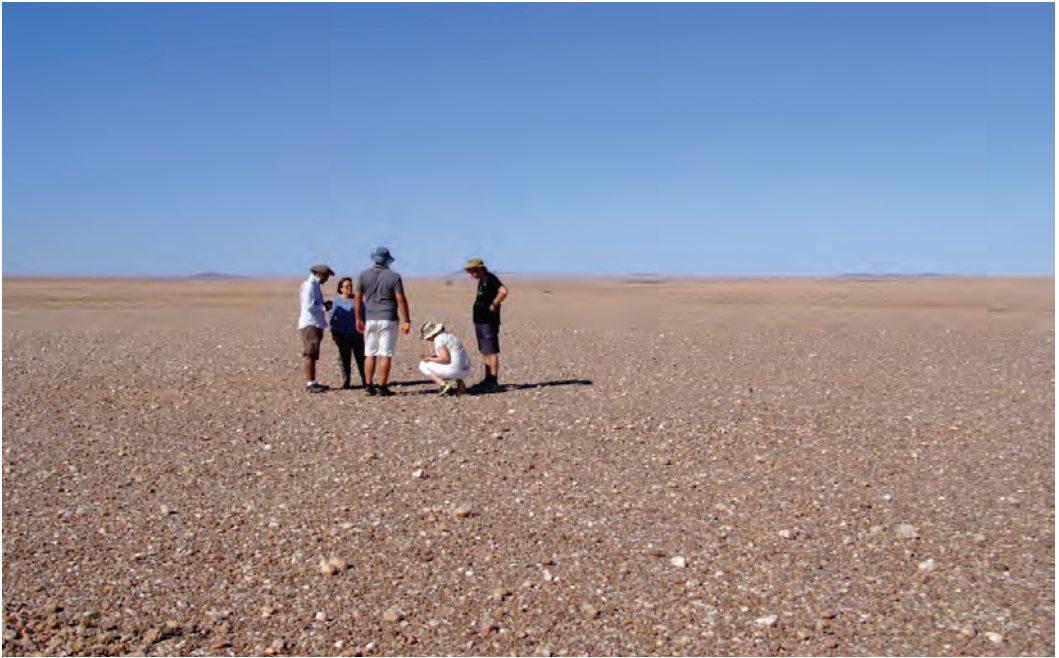
Plate 1: The quartz-rich gravel plains of the hyper-arid central Namib Desert