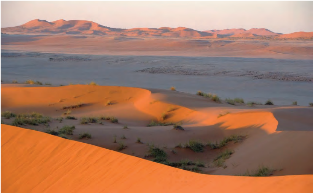
Plate 2: Dunes of the Namib Sand-Sea. The vegetated hummocks in the inter-dune valleys are clumps of speargrass ( Stipagrostis sabulicola ).