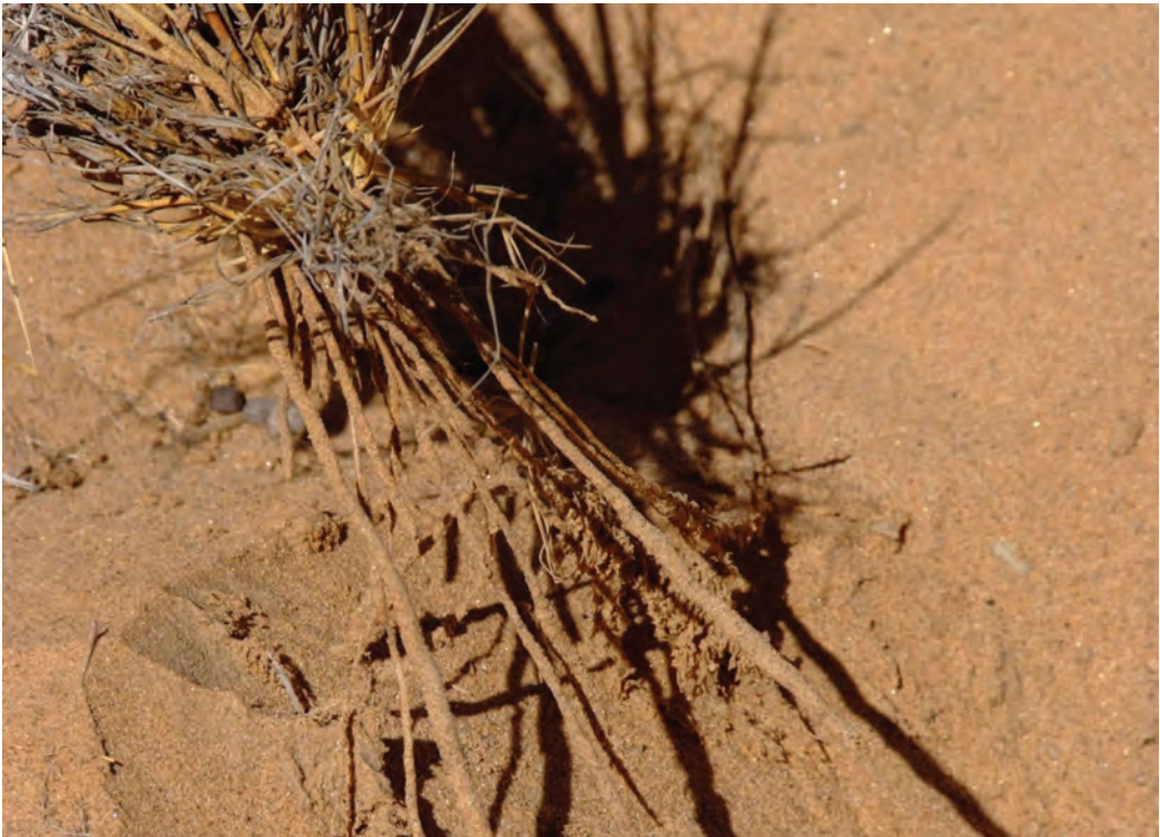
Plate 7: Stipagrostis (speargrass) rhizosheaths