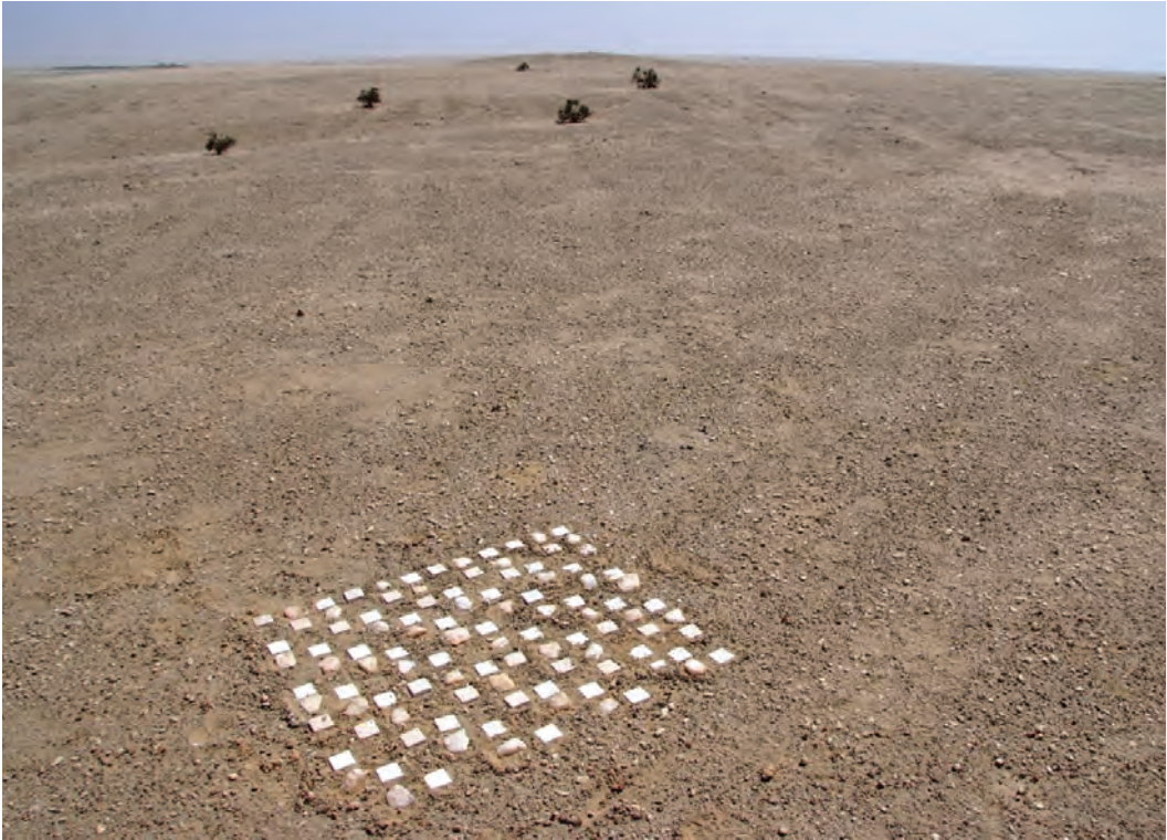
Plate 5: An artificial hypolithon array

sandstone, granite and limestone). Endolith communities in central Namib Desert sandstones were dominated by the cyanobacterial genus Chroococidiopsis , but community composition varied along an east-west precipitation gradient and was dependent upon substrate (Qu et al 2020).