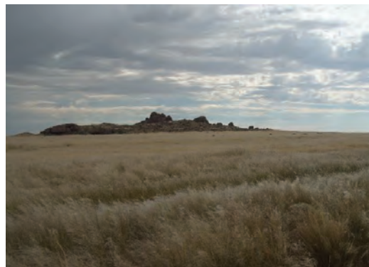
Plate 10: The central Namib Desert at Mirabebe, before and after the 2011 rains