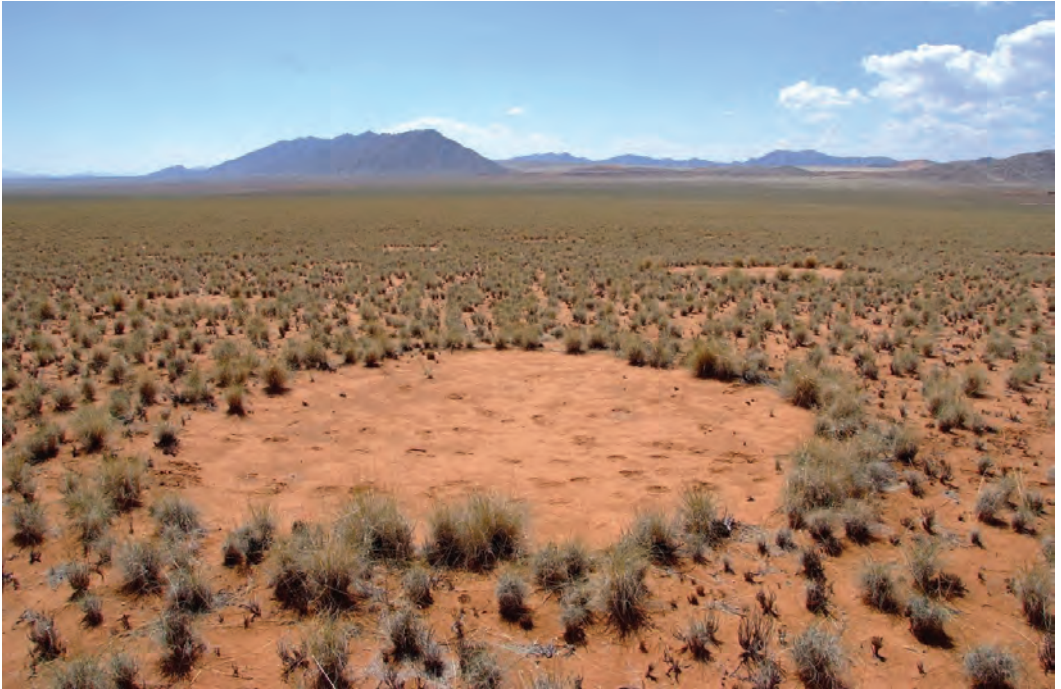
Plate 8: Fairy Circles scattered across the sands of the eastern Namib Desert

Fairy circles are found in both the gravel plains and on the margins of sand-dunes. If fairy circles are formed by microorganisms that prevent plant growth inside the circles, these microorganisms should be found in both habitats, irrespective of the geographical distance between them (~200 km, in this study). Even though the microbial communities from fairy circles in sand-dunes differed significantly from fairy circles in the gravel plains, we identified one archaeal, nine bacterial, and 57 fungal phylotypes that were consistently detected in all fairy circle soils throughout the Namib. These microbial taxa constitute putative candidates as the causative agents behind these enigmatic landscape features. We note that some of the identified taxa are closely related to well-known phytopathogens; i.e., microorganisms that are harmful to plants. However, proof of a phytopathogenic origin of fairy circles still requires the well-known Koch's postulates 2 to be fulfilled: in particular, we need to isolate the target microorganisms and prove in pot- and field-trials that they are toxic to plant growth.