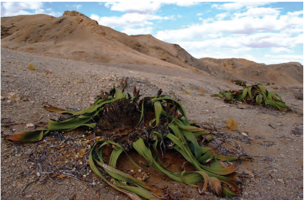
Plate 6: Mature Welwitschia plants: male (front) and female (behind)

Many desert plants have unusual modifications to their roots systems, such as cylindrical sheaths of mineral sand particles around the major roots (termed rhizosheaths). The rhizosheath is held in place by root hairs and cemented by extracellular polysaccharide ‘glue’ secreted by bacteria. Stipagrostis (the dominant grass of the gravel plains) rhizosheath microbiomes were about 1000-fold enriched compared with the surrounding sand, and were more organized: sand microbial community compositions were driven more by sand properties, and less by the plant species (Marasco et al. 2018).